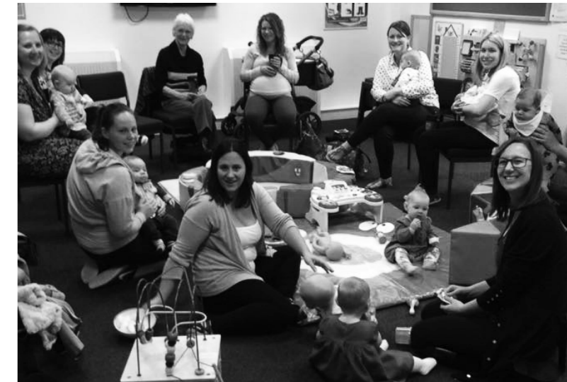
Werrington Breast Babies' meet at Werrington Community Library and Wellbeing Centre

Local communities know what their neighbourhood needs better than we do. Volunteers involved in running community managed libraries are already making a huge difference to issues important to local people.